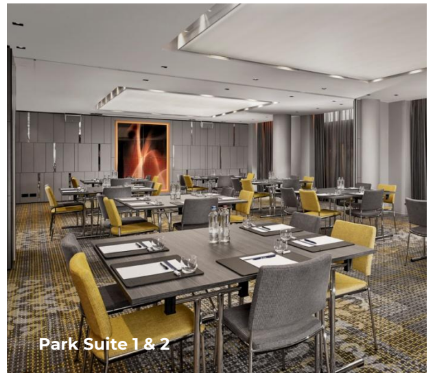
Park Suite 1 & 2