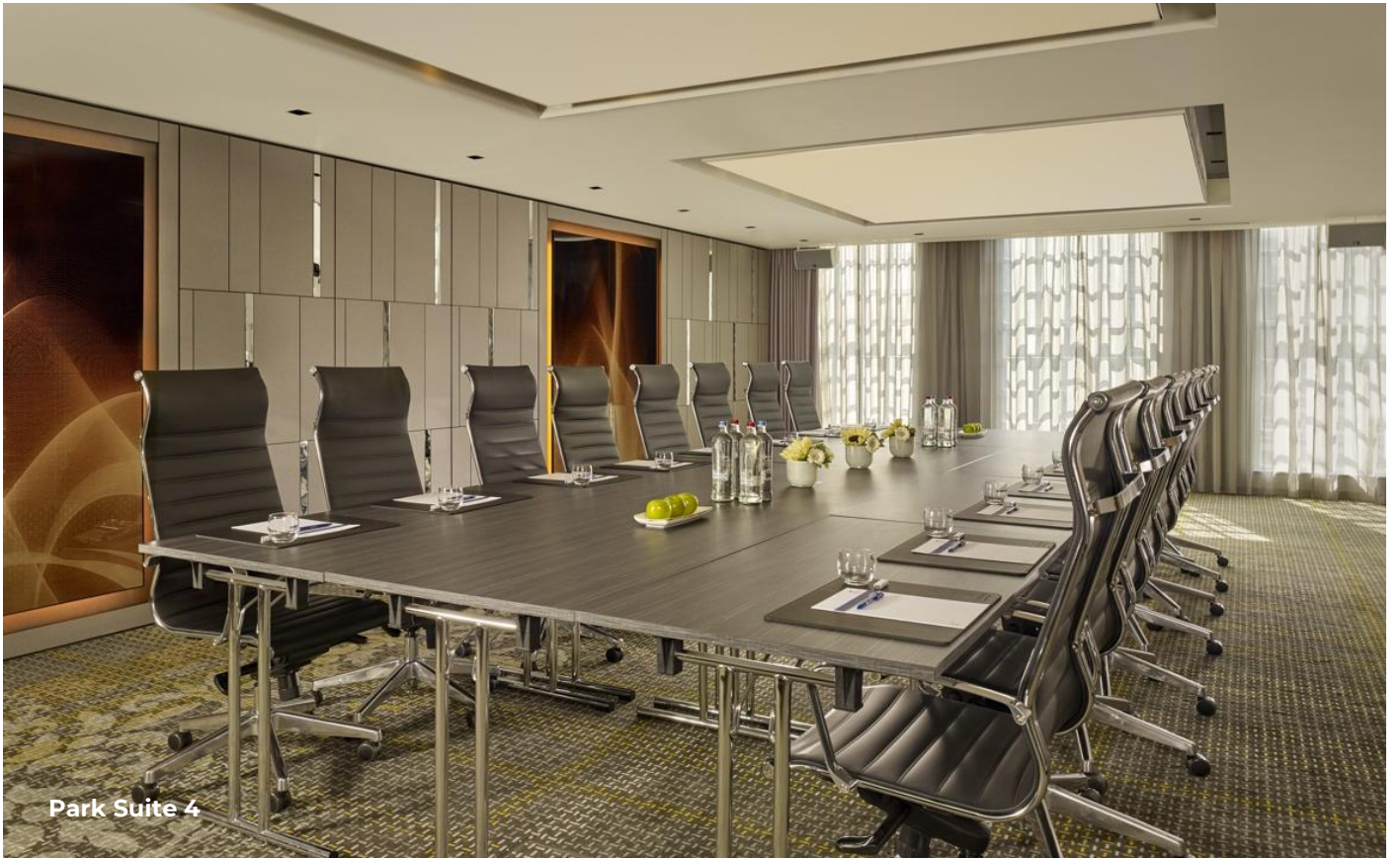
Park Suite 4